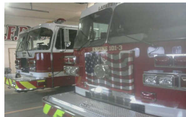
2 of LTFD's main fire engines, 101-1 (behind) & 101-3 as they were housed at station #2.