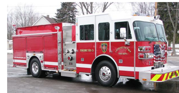
LTFD's newest Engine 101-3, a 2010 Sutphen Shield S2

The total cost of the engine is $413,521.02 and it is expected to start serving the community close to July of 2013. This engine will replace a 1994 Pierce Saber that was purchased by the Chippewa Lake Volunteer Fire Department prior to the merging of the two agencies in 2000.